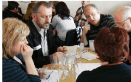
Stephenstown Pond 'think in'.