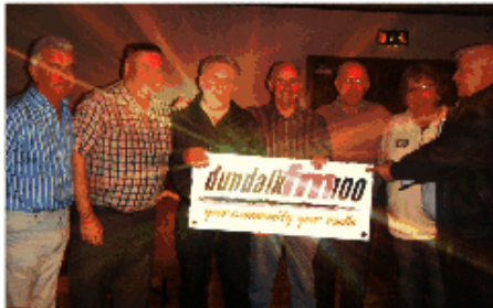
Music Quiz Champs July 2011