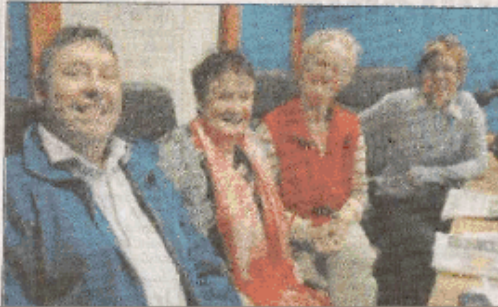
Ability Focus, Dundalk FM.