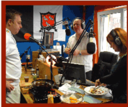
New Radio Presenters